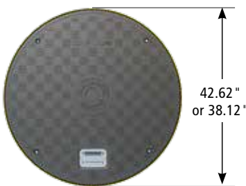
Cover 1" Thick